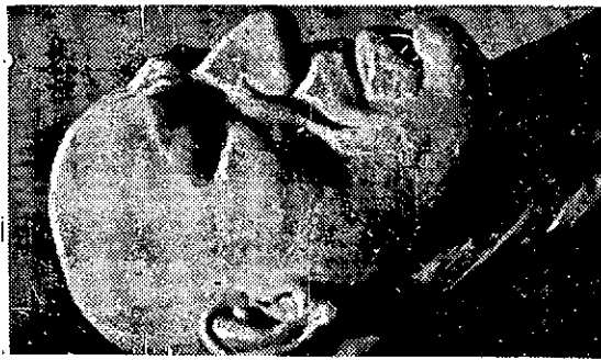
French Angel to appear in near future.