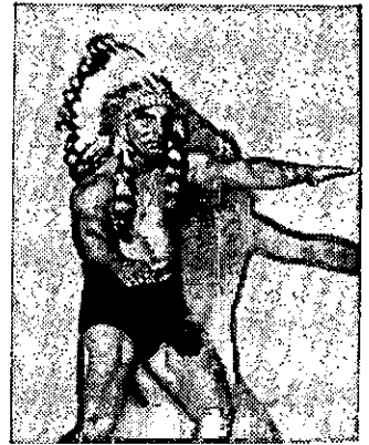
CHIEF LITTLE EAGLE

Cooking for Calhoun is a full time job. For breakfast he puts away a dozen eggs, a pound of sausage, and a pound of bacon, two dozen biscuits, a pile of fried potatoes, and a gallon of milk. He never eats lunch when he's wrestling, but after the match, he sits down to five or six pounds of beef, four pounds of potatoes, red beans, carrots, corn and peas and a gallon of milk. He said, "I have to earn plenty of money neighbors, to keep myself supplied with vittles, when I eat at home it costs my wife $125.00 a week for my food bill, and when I eat in restaurants they jump to $225.00 a week. So be sure to see Haystack Calhoun when he appears here.