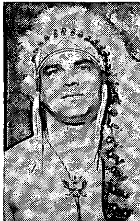
CHIEF LITTLE EAGLE