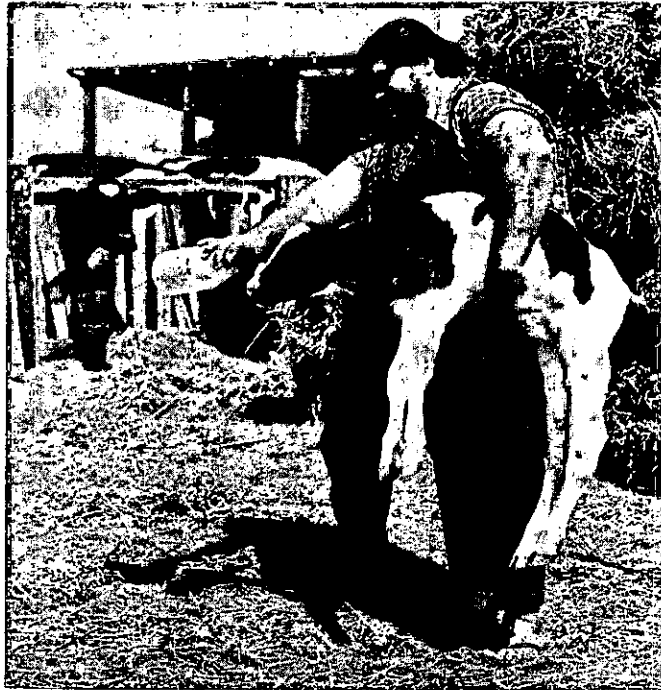
COUNTRY BOY HAYSTACKS CALHOUN

ATLANTA AUD.—Feb. 5th MARIETTA, GA.—Feb. 12th MARIETTA, GA.—Feb. 19th MARIETTA, GA.—Feb. 26th